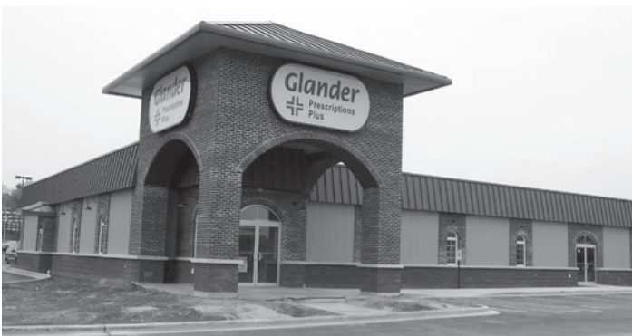
The new Glander building features a brick tower that serves as a "beacon," guiding customers to their new Superior Ave. location.

"We love every aspect of our building," states Bob. "If we had to do it all over again, we would not do anything different, including choosing A.C.E. as our design/build contractor."